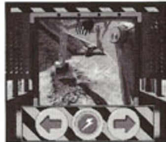
The D-Pad Control Panel